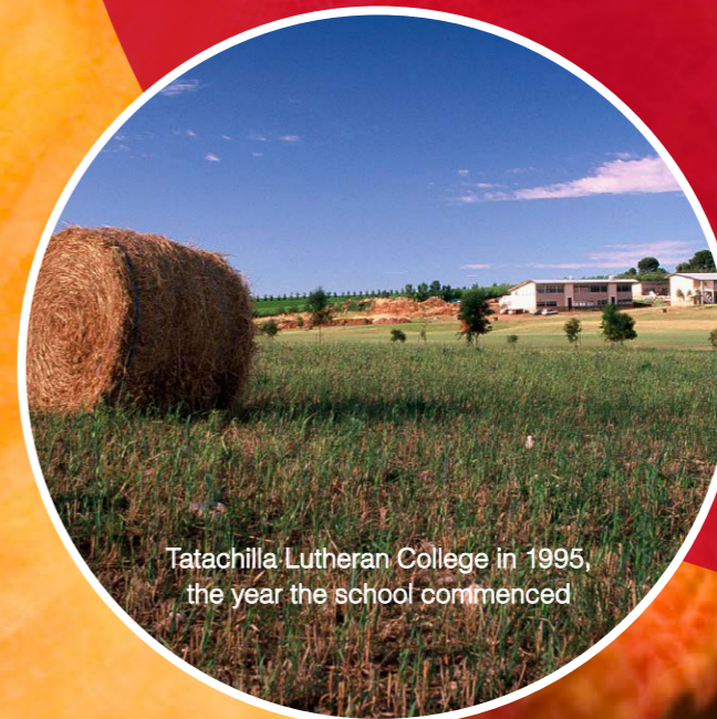
Tatachilla Lutheran College in 1995, the year the school commenced

Like the rock that underlies the college's footings, our students are nurtured to be grounded, steadfast and anchored in both spirit and mind.